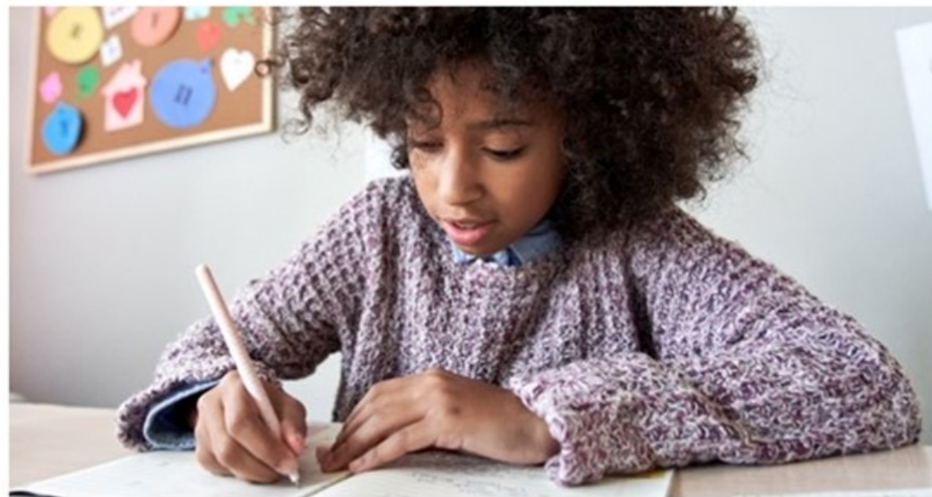
Pictured: Writing.

Share your thoughts and read the opinions of others