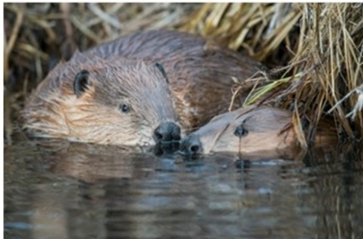
Pictured: Beavers.